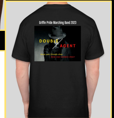
Show Shirt (Back) ↑