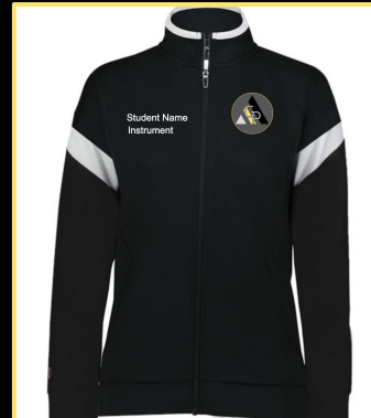
Optional Jacket ↓