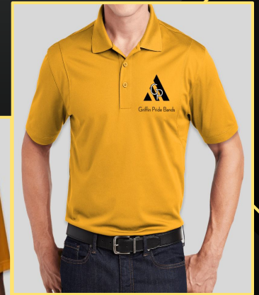
Band Student Polo ↑