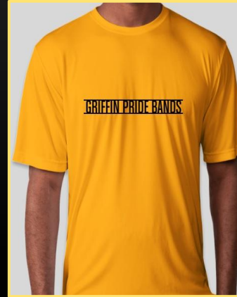
Athletic Shirt ↓